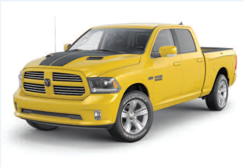
The Ram Truck brand announced that it has added a new limited-edition Ram 1500 model in Sport trim — the Ram 1500 Stinger Yellow Sport.

The Sport interior complements the Ram 1500’s confident exterior design with a predominantly black cockpit, highlighted with Light Black Chrome and yellow details. Interior treatments include body-